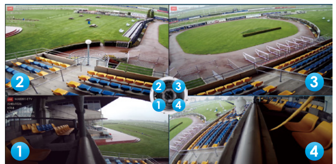
Multiple sensors, Adjustable views