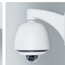
Gooseneck Wall Mount