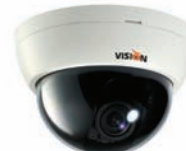
VD101SMi 1,3MP/HD, 3,7mm