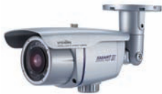
VN6XSMi 1,3MP/HD, 3,7mm