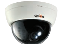
VD101SMi-IR 1,3MP/HD, 3,7mm