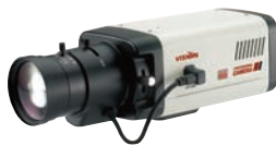
VC58SM3i 3MP/Full HD