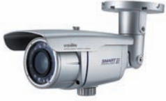
VN7XHD 720p(50/60fps) VN7XFHD 1080p(25/30fps)