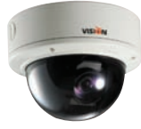
VDA110HD-DN 720p(50/60fps) VDA110FHD-DN 1080p(25/30fps)