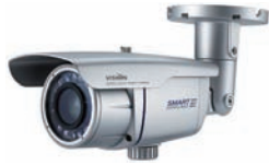
VN7XSM3i 3MP/Full HD