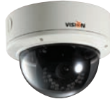
VDA110SM3i-IR 3MP/Full HD