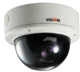
VDA110SM3i 3MP/Full HD