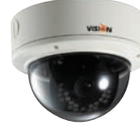
VDA110HD-IR 720p(50/60fps) VDA110FHD-IR 1080p(25/30fps)