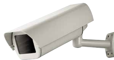
HEB + WBOVA2