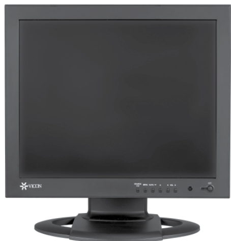
VM-717LCD-1 and VM-719LCD-1