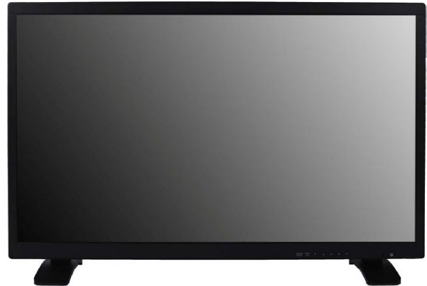
VM-632LED and VM-642LED