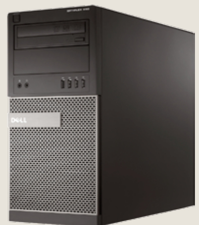
S-VMX Video Wall hardware is based on a mini tower workstation and it is available with 2 monitor outputs.

Standard S-VMX Video Wall Controller is delivered in a mini tower workstation.