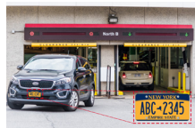
Capture and recognize vehicle plates