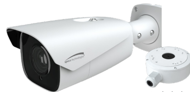
Included Junction Box