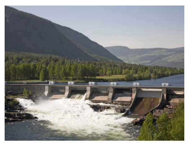
This is where iSTAR Ultra Video excels - providing these critical sites with a small footprint a reliable security solution that can scale to hundreds or thousands of sites...all linked together and managed by a central command center. And all with a reasonable price tag.