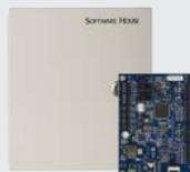
IP-ACM Door Modules