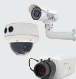
Illustra IP Cameras