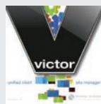
victor Unified Client