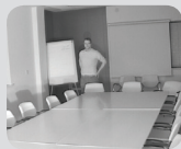
Infra-Red on Internal