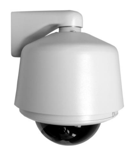
ENVIRONMENTAL PENDANT MODEL SD5TAC-PG-E0 (SHOWN WITH SWM-GY WALL MOUNT)

The Spectra Lite™ Series Surveillance Dome System is a lower cost alternative to Pelco's popular Spectra II Series Dome. The Spectra Lite features a high resolution, Integrated Optics Package (IOP) camera, full pan/tilt positioning mechanism and extensive receiver electronics. Spectra Lite is quick and easy to install and onscreen, user-friendly menus make it easy to program and operate.