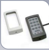
PROXIMITY KP50 keypad 355-110 £120.00