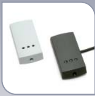
PROXIMITY P38 reader 333-110 £99.00