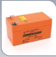
12V 1.2AH battery for 1A boxed PSU 339-425 £15.00