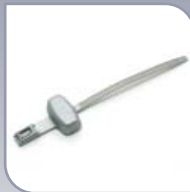
Unencoded PROXIMITY Watchprox, silver 202-782SL £2.50