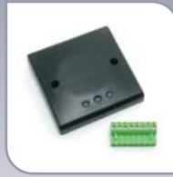
PROXIMITY backbox reader black 370-225BL £135.00