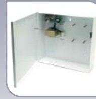
2A 12V dc boxed power supply with mains monitoring 857-693 £84.00