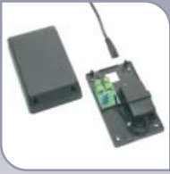
12V dc 1A power supply in black plastic housing 998-241 £14.00