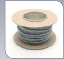
Reader cable 10 core CR9540 10m roll 166-010 £12.00