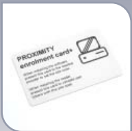
PROXIMITY enrolment card plus for additional site 542-990 £50.00