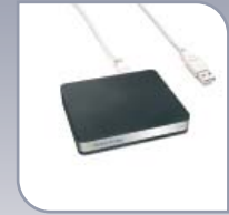
PROXIMITY encoding system USB 412-500 £70.00