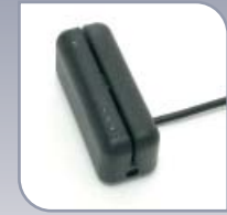
CARDLOCK reader black plastic external 266-898 £60.00