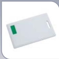
Unencoded PROXIMITY card green 202-668G £2.50