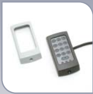
TOUCHLOCK K38 keypad 331-110 £60.00