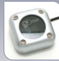
PROXIMITY metal reader 390-747 £150.00