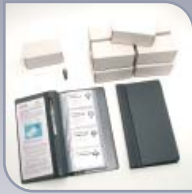
PROXIMITY 100 keyfob pack green 820-100G £350.00