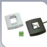
Exit button E75 with screw connector 376-320 £25.00