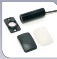
PROXIMITY vandal proof reader 568-855 £135.00