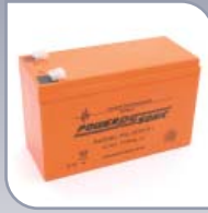
12V 7AH battery for 2A boxed PSU 862-719 £22.50