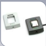
Exit button E50 356-310 £25.00