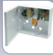
1A 12V dc boxed backup power supply 339-424 £49.50