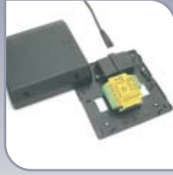
Switch2 control unit and 1A PSU in black plastic housing 242-166 £95.00