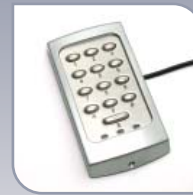
TOUCHLOCK K75 stainless steel keypad 372-110 £80.00