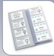
CARDLOCK 100 card starter pack 850-100 £150.00