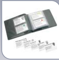
PROXIMITY function card pack 820-000 £40.00