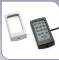
TOUCHLOCK K50 keypad 351-110 £60.00