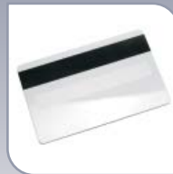
Unencoded PROXIMITY ISO card 202-630 £4.00