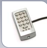
TOUCHLOCK K38 stainless steel keypad 332-110 £80.00