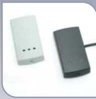
PROXIMITY P50 reader 353-110 £99.00