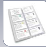
CARDLOCK function card pack 877-012 £40.00