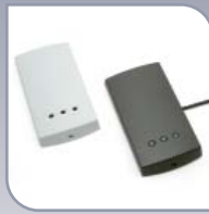
PROXIMITY P75 reader 373-110 £99.00