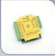
Switch2 control unit 405-321 £80.00