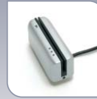
CARDLOCK reader satin chrome 409-711SC £110.00