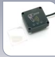
PROXIMITY panel mount reader 390-135 £135.00