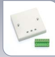
PROXIMITY backbox reader white 370-225WT £135.00