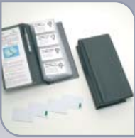
PROXIMITY 100 card pack green 830-100G £350.00