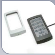
PROXIMITY KP75 keypad 375-110 £120.00