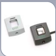
Exit button E38 336-310 £25.00