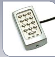
TOUCHLOCK K50 stainless steel keypad 352-110 £80.00