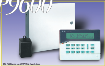
GEM-P9600 Control and GEM-SP1CAe2 Keypad, shown.

NAPCO's Gemini™ GEM-P9600 is a powerful multi-tasking hybrid control panel. It is feature-rich for both security applications and seamless home automation integration.