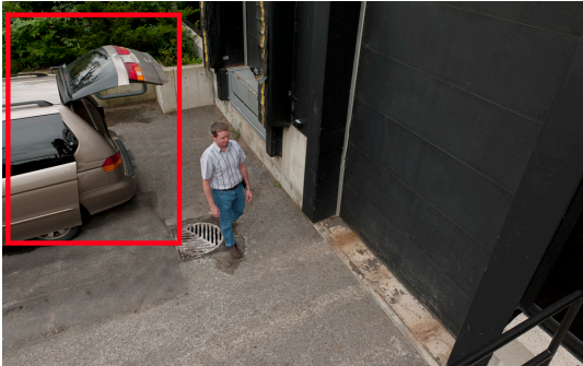
The "Loitering Detection" analytic triggers an alarm when a person or object lingers in a particular area for too long.

Rugged 4MP IR bullet camera with built-in video analytics and HDR technology