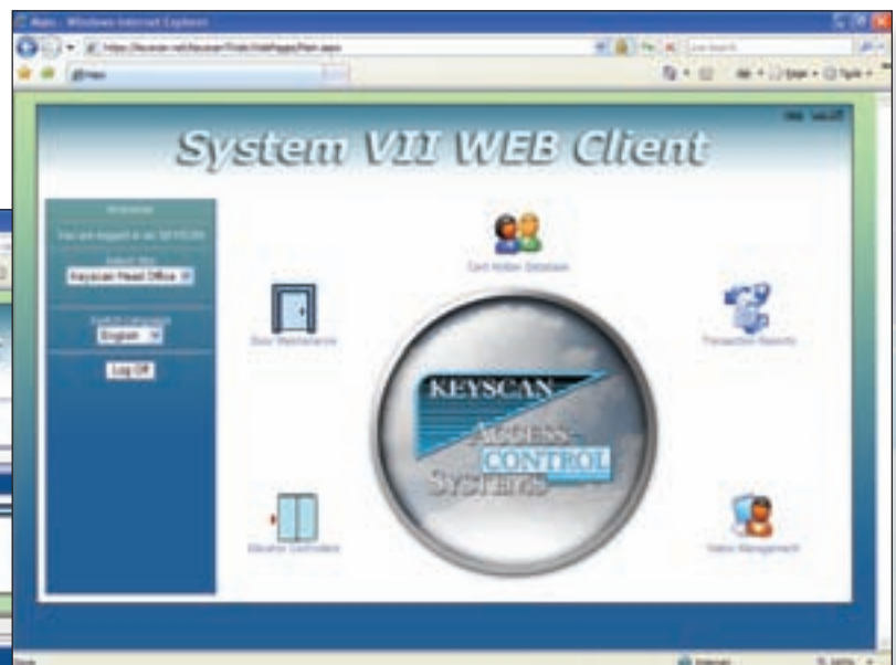
Main Web Page