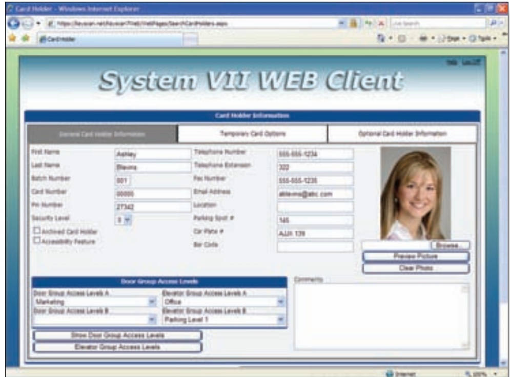
Card Holder Management