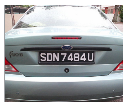
White letters on dark backgrounds