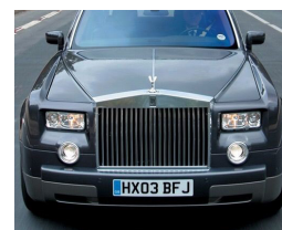
Dark letters on a light backgrounds