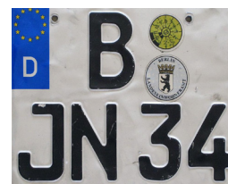
Double line license plates