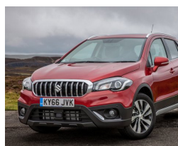
Vehicle approach angles