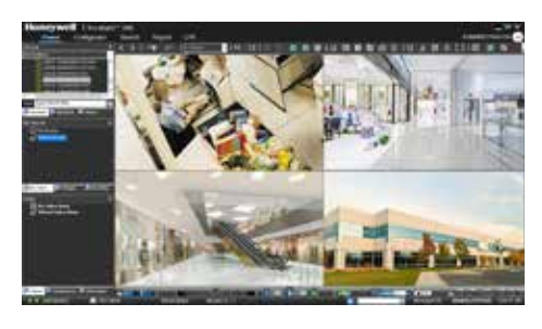
Pro-Watch VMS Client Viewer

Control of Pro-Watch VMS can be through a traditional joystick controller, mouse or even through third party interface. The extremely powerful rules engine (Macro's) allows customization of the system to respond and control in the best possible manner for the application.