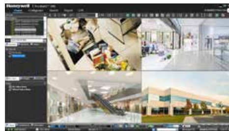
Pro-Watch VMS Client Viewer

The whole Pro-Watch VMS products contain no content or material from any companies or their subsidiaries prohibited under US National Defense Authorization Act (NDAA) Section 889 and can be used as part of video systems which comply with NDAA Section 889.