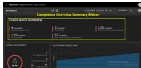
Pro-Watch Intelligent Command

As an integral part of Pro-Watch Integrated Security Suite, Pro-Watch VMS works seamlessly with access systems in a unified interface, Pro-Watch Intelligent Command, offering intuitive map navigation across sites, buildings and floors, and camera live view pop-up, instant playback and alarm and workflow association, as well as bulk camera firmware update and password modification, which enables customers to obtain situational awareness and manage their facility efficiently. A new Safety Compliance Dashboard for Healthy Buildings KPI's provides ability to view compliance and incidents from a single view.