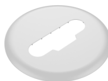
DS-1227ZJ-P1 In-ceiling mount