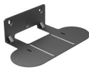
DS-2102ZJ Wall mount