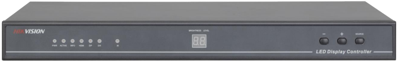
Figure 1. DS-D42C04-H Sending Card