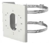
DS-1275ZJ-S-SUS Vertical Pole Mount