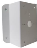
DS-1276ZJ-SUS Corner Mount

COMPLIANCE NOTICE: The thermal series products might be subject to export controls in various countries or regions, including without limitation, the United States, European Union, United Kingdom and/or other member countries of the Wassenaar Arrangement. Please consult your professional legal or compliance expert or local government authorities for any necessary export license requirements if you intend to transfer, export, re-export the thermal series products between different countries.