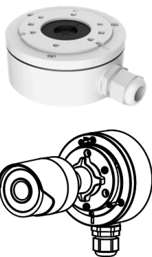
DS-1280ZJ-XS Junction Box