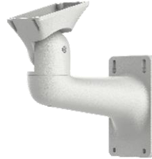
DS-2202ZJ Integrated Mount