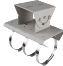
DS-1214ZJ Horizontal pole mount