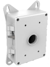
DS-1674ZJ Junction Box