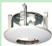
DS-1227ZJ In-ceiling mount