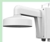
DS-1273ZJ-135B Wall mount with Junction box