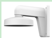
DS-1273ZJ-135 Wall mount