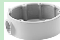
DS-1280ZJ-DM21 Junction box