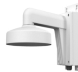
Wall mount + junction box