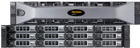
2U Rack-Mount Raid Server