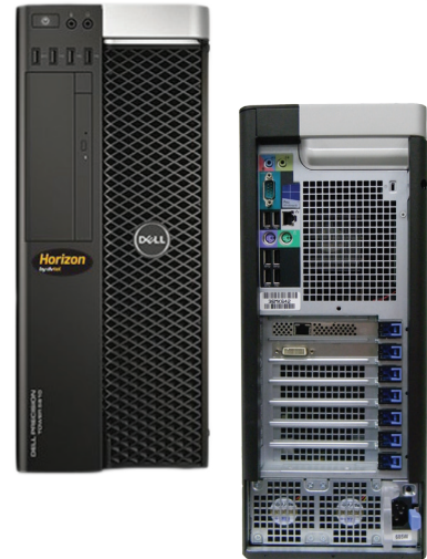
Workstation with Extended Storage

The Horizon NVR Workstation is a reliable, cost-effective solution for installations requiring up to 48 cameras. This open-standard NVR eliminates the need for additional client workstations solely for viewing purposes. With its extended storage reaching up to 12TB and improved performance, it allows for more cameras and higher throughput, which is ideal for control centers that monitor many live HD streams.