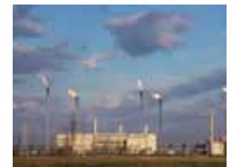
Petrochemical & Chemical industries

Specifications and prices subject to change without notice. Images used for illustration purposes only. Copyright © 2011 FLIR Systems. All right reserved including the right of reproduction in whole or in part in any form.