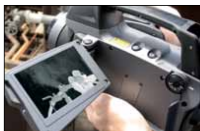
Tiltable, flip-out 4.3" High Contrast Color LCD allows you to view targets more safely from any angle.