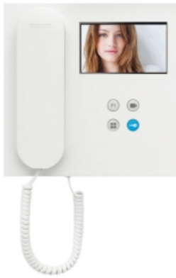
COLOUR DUOX VEO MONITOR 4,3"