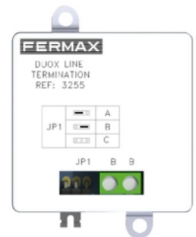
DUOX LINE ADAPTOR