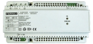
P.S.U. DIN10 230VAC/12VAC+18VDC- 1.5A