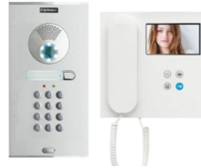
1/W COLOUR VEO DUOX MEMOVISION CITY KIT