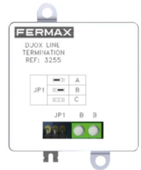
DUOX LINE ADAPTOR