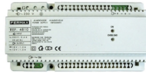
P.S.U. DIN10 230VAC/12VAC+18VDC- 1.5A