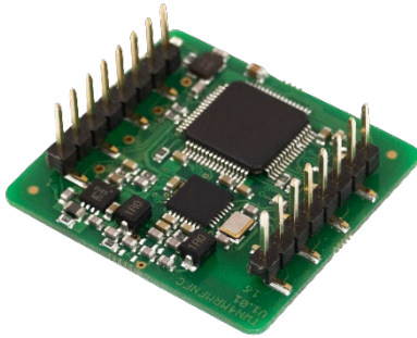
TWN4 MultiTech HF Mini Top view