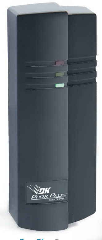
ProxPlus Secure Model 1815-684 Mullion Mount