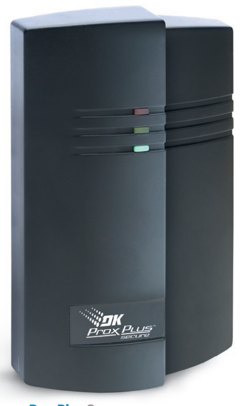
ProxPlus Secure Model 1815-685 Single Gang Box Mount