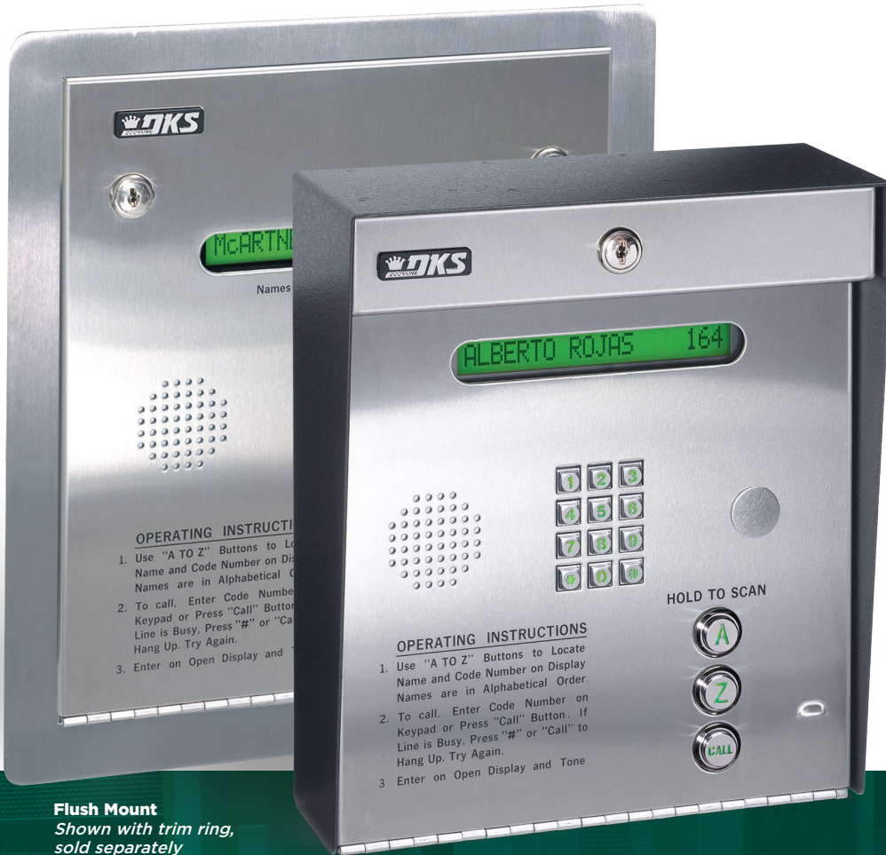
Flush Mount Shown with trim ring, sold separately