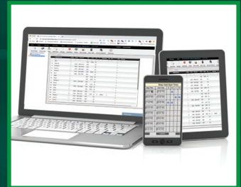
DKS Cloud Programming available with DKS Cellular, VoIP Internet or IM Server subscriptions.