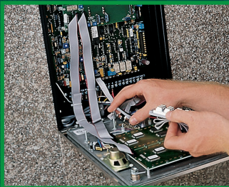
Modular easy installation and service.

Voice and Remote Programming use DKS service options for connection and programming