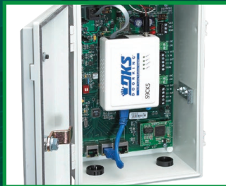
Internet Connection A Plug and Play solution that provides both voice and data via your existing internet connection. *DKS subscription service required.