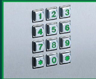
Internal LED lit keypad and A-Z-CALL buttons.