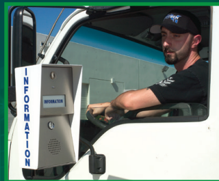
Full-Duplex High quality communication - the same standard that the phone company uses