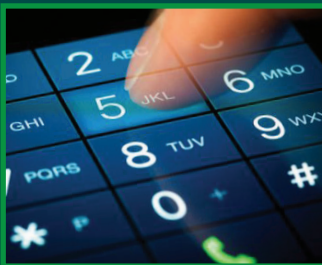
Control Access with a simple push of a button on your touch-tone telephone

GATED COMMUNITIES • APARTMENT COMPLEXES PARKING • CONDOMINIUM/RESIDENT HALL • MIXED USE COMMERCIAL • SELF STORAGE • MAXIMUM SECURITY