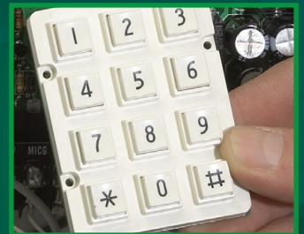
Keypad Programming manual internal keypad for programming