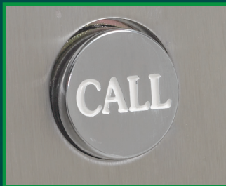
Single CALL with the push of a button