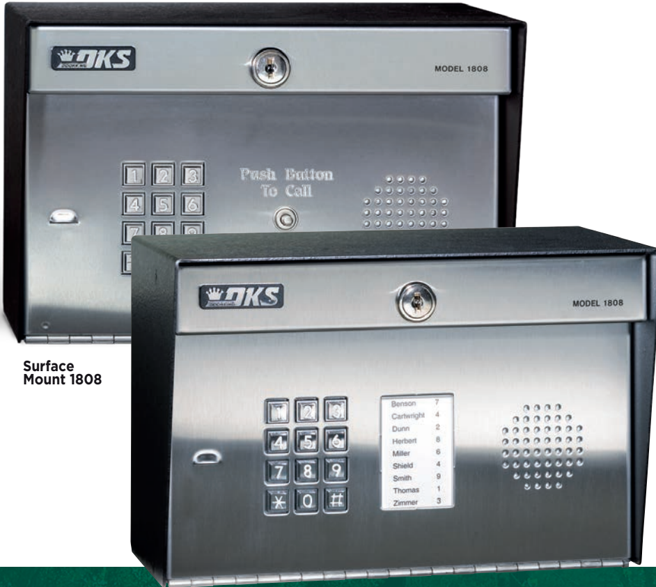
Surface Mount 1808

Ideal for residential and small commercial or apartment applications