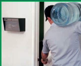
Surface Mount with built in directory/message window 1808 / 1808-AP

Flash Entry Codes allow entry on a single day only, then automatically deactivate themselves