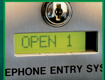
Built-in Display indicates door/gate has been opened