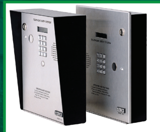
Two Mount Styles surface and flush are available