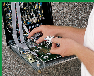
Modular Design makes installation and service easy

SELF-STORAGE • APARTMENT COMPLEX/GATED COMMUNITIES • PARKING • APARTMENT/COLLEGE RESIDENTS HALLS • MIXED USE BUILDINGS • COMMERCIAL/INDUSTRIAL • MAXIMUM SECURITY