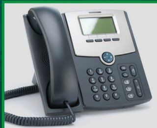
DTMF Tone Output useable with PBX, KSU and telephone systems with auto-attendants