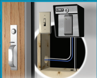
Simple Wiring easily connects to most electric strikes and magnetic locking devices

SELF-STORAGE • APARTMENT COMPLEX • GATED COMMUNITIES • RESIDENTIAL • PARKING • APARTMENT/COLLEGE RESIDENTS HALLS • MIXED USE BUILDINGS • COMMERCIAL/INDUSTRIAL