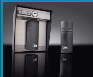
1524 Basic available with or without housing