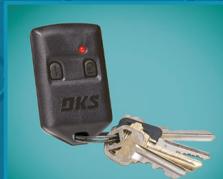
Proxmitters Combines a RF Transmitter with a proximity card tag