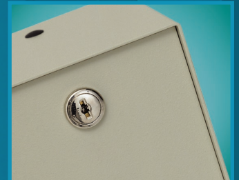
Weigand Controller add your own 26-bit wiegand device for use in a stand-alone application