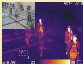
Picture in Picture