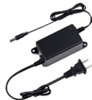
FM320 12V 2A Power Adapter