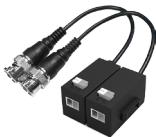
PFM800-E Passive HDCVI Balun