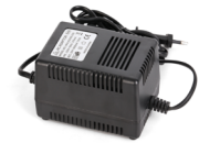
AC24V/3A Power Supply