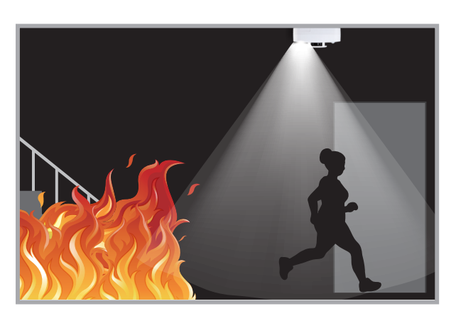
Emergency light provides illumination in environment of darkness or dim light