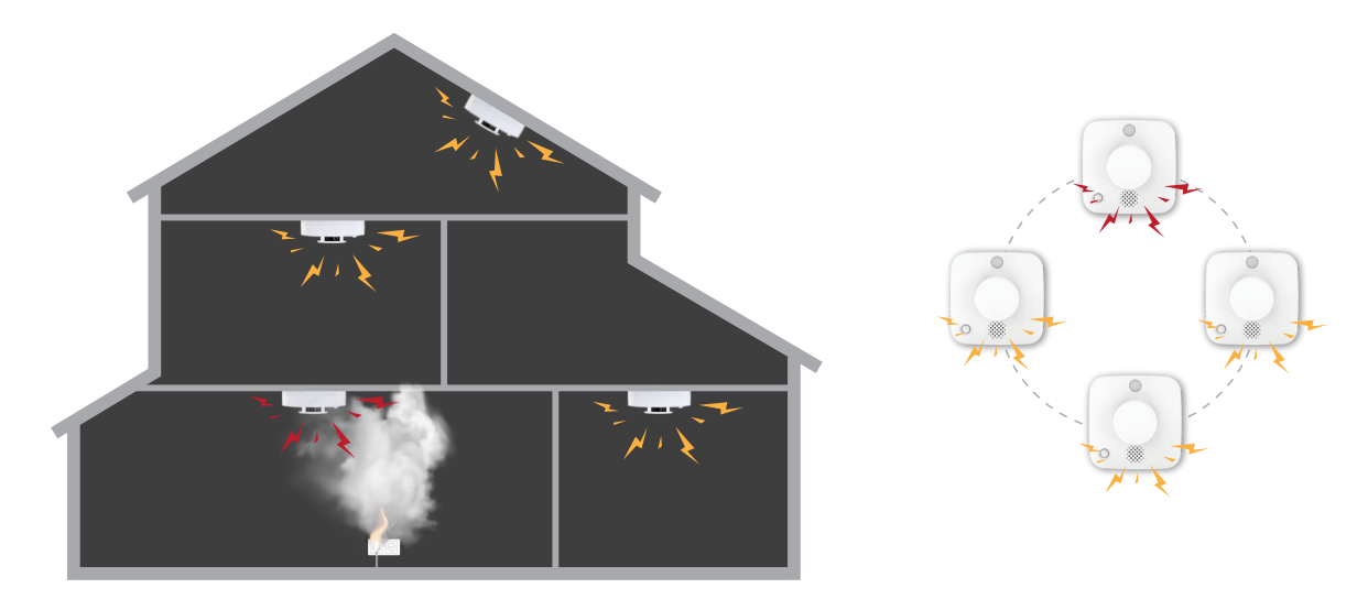
Serial connection enables all connected smoke alarms to sound together when one of them is triggered