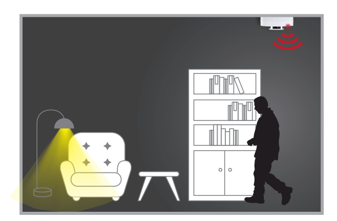
PIR motion sensor for home automation lighting control