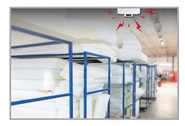
Differentiate between fast moving fire and slow smoldering burn, including flaming polyurethane foam