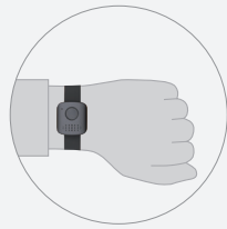
worn as watch