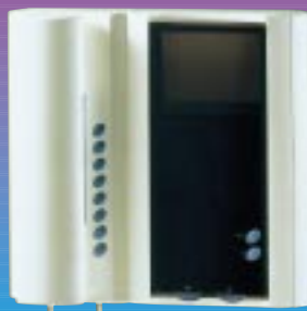
The Exedra XVF/200 slim line modular monitor