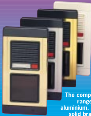
The complete Modular range available in aluminium, brass effect, solid brass and white