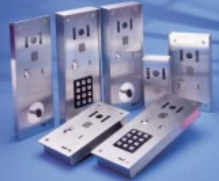
The robust range of vandal resistant entry panels, also available flush in solid brass