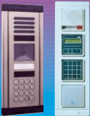
Coded Call, VTD/100 stainless steel and modular digital entry panels. Modular panels available in white, aluminium and brass effect