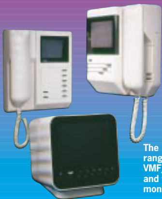
The System 100 range of monitors VMF/100, VM/100 and the 8" cube monitor the VM/110