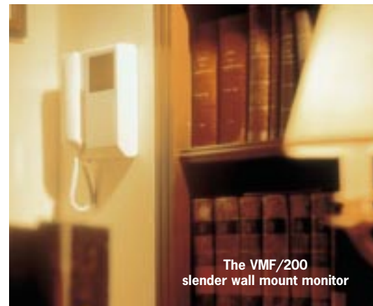
The VMF/200 slender wall mount monitor