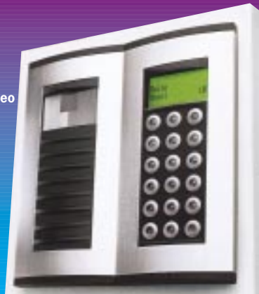
Targha HAC/200 digital call panel with HSV/OST video entry panel