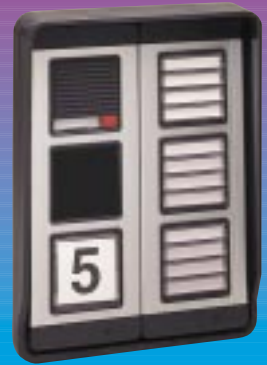
Modular entry panel with rain shield, information module and 12 buttons