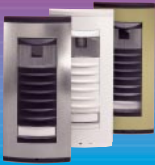
Slim line, elegant Targha entry panels in anodised aluminium, brass effect or white finishes