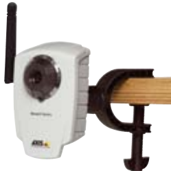
AXIS 207/207W/207MW Network Camera with flexible clamp - clamp included