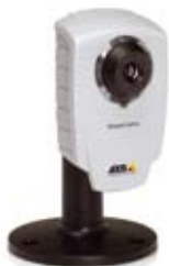
AXIS 207/207W/207MW Network Camera with camera stand - stand included