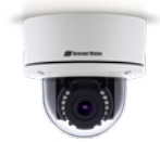
Surface mount dome

Create Your Model (Example: AV05CLD-100)