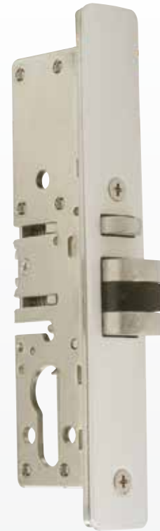
524570 Lock Type