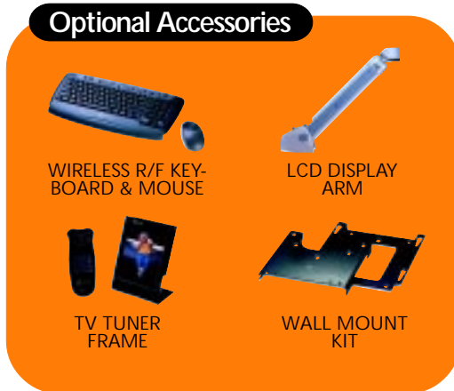
WIRELESS R/F KEYBOARD & MOUSE