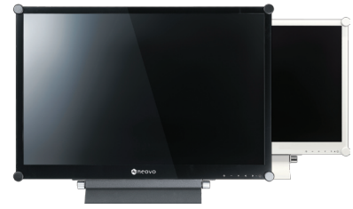
Available in black or white