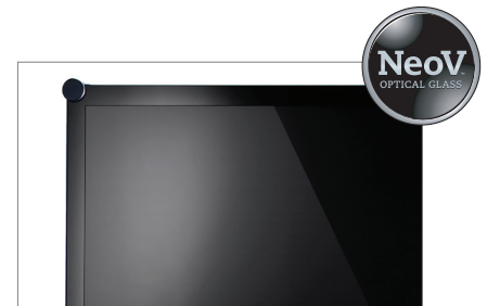
NeoV™ Optical Glass protects against scratches, impacts and other physical damage