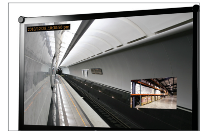
On top of PIP and PBP, Smart Omni Viewer offers selectable aspect ratios and the option of 180° image rotation